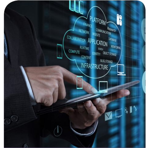
For the Government

Every Hospital administrator wants to streamline clinical workflows and enable better patient care. The SV9300 lets hospitals meet the challenges of healthcare information sharing head on. From managing the flow of the patients in the reception area, to ensuring that physicians, nurses and staff can be reached from one phone extension wherever they may be in the hospital. The SV9300 is a unique solution that reduces the administrative and process-driven strains on your IT system, so your staff can get back to what they do best: caring for patients.