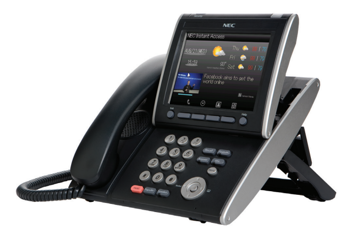
DT750 IP Terminal with Color Touch Screen LCD